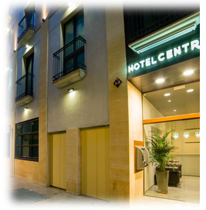
Hotel Centre Reus *** http://hotelcentrereus.com/home/