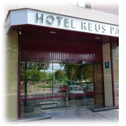
Hotel Reus Park *** http://en.hotelreuspark.com/