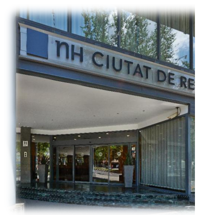
Hotel NH Ciutat de Reus **** http://www.nh-hotels.com

Participants are expected to arrange their own accommodation. Among the hotels of the following list, Reus Park Hotel is the closest to the venue of the conference (5-minute walk) and Hotel Gaudí, Hotel Centre Reus and NH Hotel are inside a reasonable walking distance: